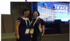
Two founders met at GHC13